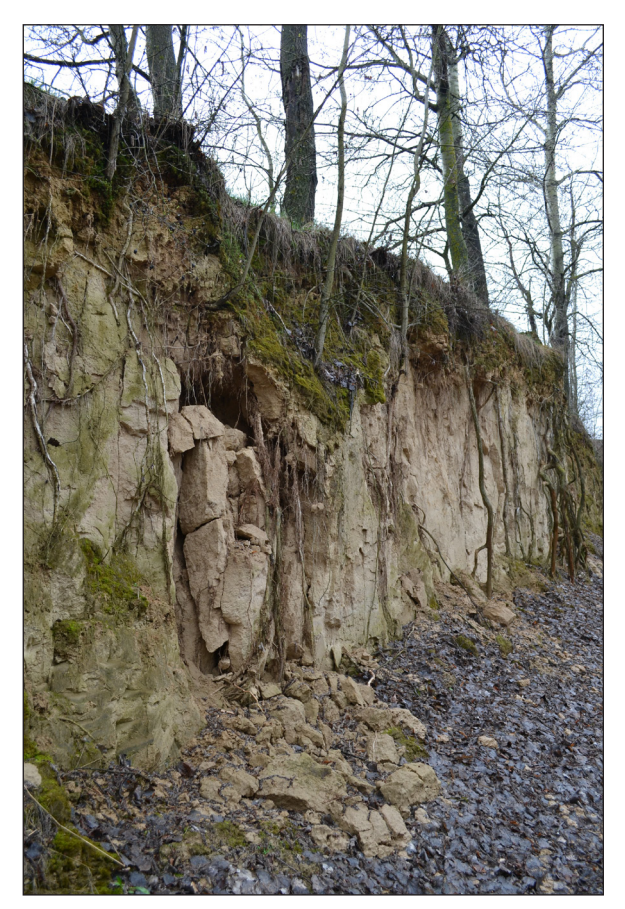
Figure 2. Loess falling off vertical slopes of the gully

The suffosion processes occur on a left slope in a middle and a lower part of the gully. Four sinkholes have been identified in 2015 with diameter from 3 to 6 metres and depth of 3.5 - 5.5metres. They developed as a result of the inflow from 3.5 ha catchment on arable fields near the gully. With no safe catchment draining, water erodes or infiltrates slopes, resulting in development of sinkholes and suffosion corridors with outlets near the gully mouth. One of the corridors